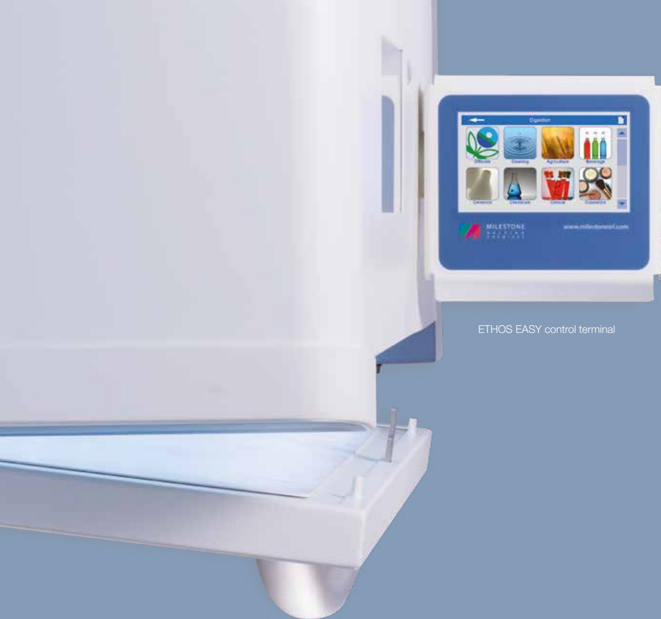
ETHOS EASY control terminal

HIGHEST MICROWAVE POWER • The ETHOS EASY is equipped with two 950 Watt magnetrons for a total of 1900 Watt. A rotating diffuser that evenly distributes the microwaves throughout the cavity. Fast and homogeneous heating are assured.