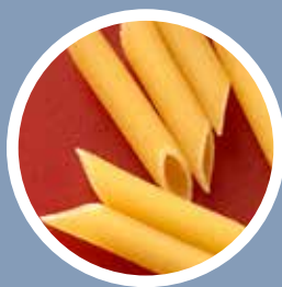
Food and Feed