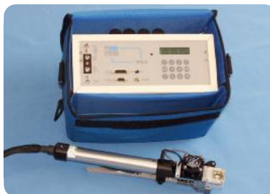
TPS-2 Main Console and Leaf Cuvette

Measurement of CO 2 uptake is the most commonly used and easiest method for determination of photosynthesis in plants. Using infrared gas analysis techniques, we can readily determine CO 2 concentrations to within 1 ppm and instantaneous, non-destructive measurements are possible. The TPS-2 passes a measured flow of air over a leaf sealed into a chamber called the "leaf cuvette". Using a "gas switching" technique, the TPS-2 first samples the CO 2 and H 2 O of the air going to the cuvette (reference) and then the air leaving the cuvette (analysis). From the flow rate and the change in concentrations, the assimilation rate of CO 2 and transpiration rate of water can be determined. This technique is commonly referred to as the "open" system method of measurement and is the method employed by the TPS-2. Designed for use under the most demanding field conditions (high temperature and humidity, dust), the system is equipped with an internal, hydrophobic filtering system ensuring that all internal parts are fully protected.