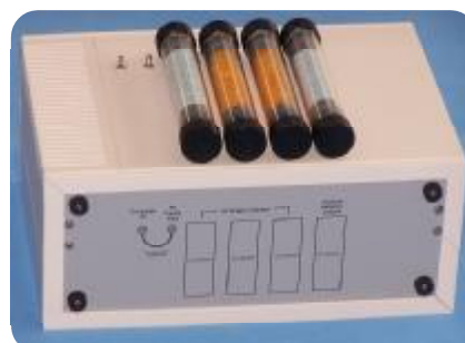
Self-indicating desiccants for analyzer zeroing and CO 2 /H 2 O control

The TPS-2 is also capable of controlling CO 2 at higher concentrations if used with an external gas cylinder.