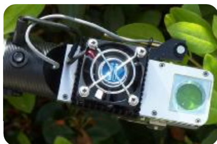
Close-up of PLC4 (B) leaf cuvette head