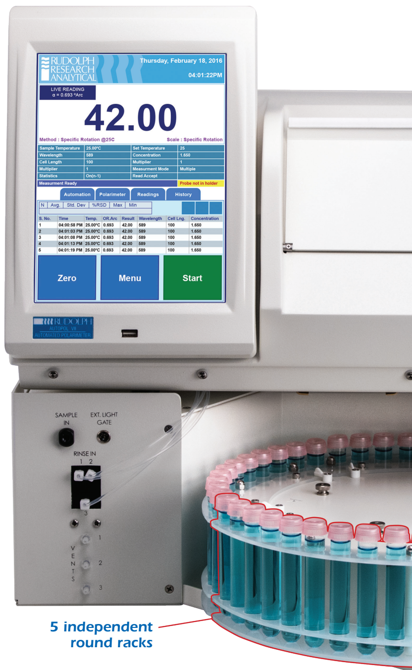
5 independent round racks