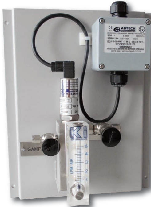
Wall Mounted Sample System (optional)

For integrated, cost effective moisture analysis for OEM's and multiple sampling points