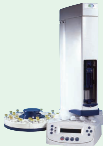
Vial Autosampler Option

Ensures the instrument is always performing to it's highest degree of accuracy - essential for HACCP compliance.