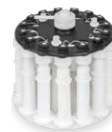
MMR-15 Evaporation/ Concentration rotor