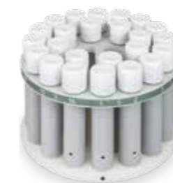
fastEX-24 Extraction rotor for environmental sample

Microwave Muffle Furnace for fast ash determination