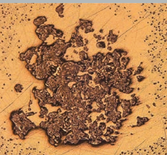
Figure 1: Re-polished sample with pre-spark crater