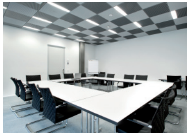
Seminar room 1