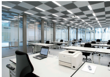
Service instruction room