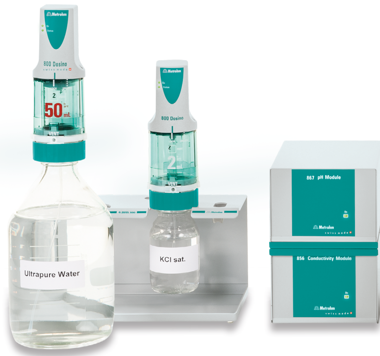
Metrohm MATi 14 dedicated for conductivity measurements according to USP<645> in up to 28 samples.

During the stage 3 testing a small amount of KCl is added to the sample to ensure a stable pH value. The measured conductivity in step two has to be lower than a stipulated limit for the measured pH value. If this value is exceeded, the testing failed, and the sample is not compliant.